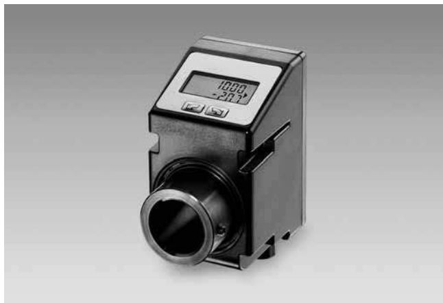
N 142 with cable output