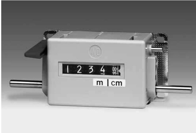
M 410.A - PTB Meter counter