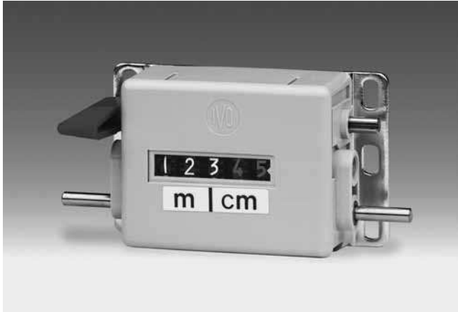
M 310.A - PTB Meter counter