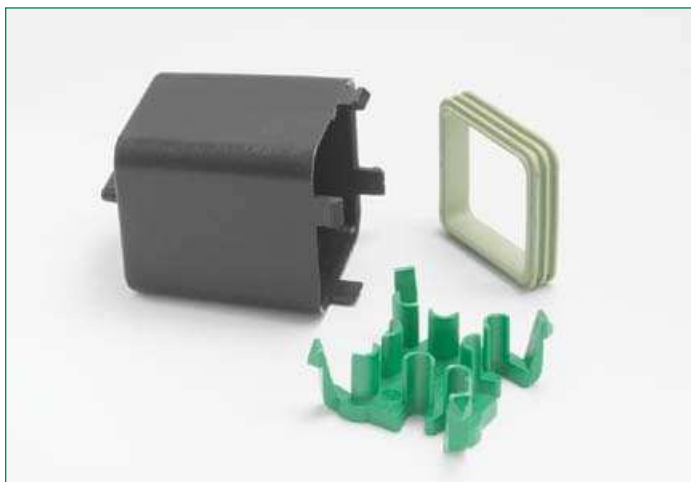
Dimensions in mm / Maße in mm