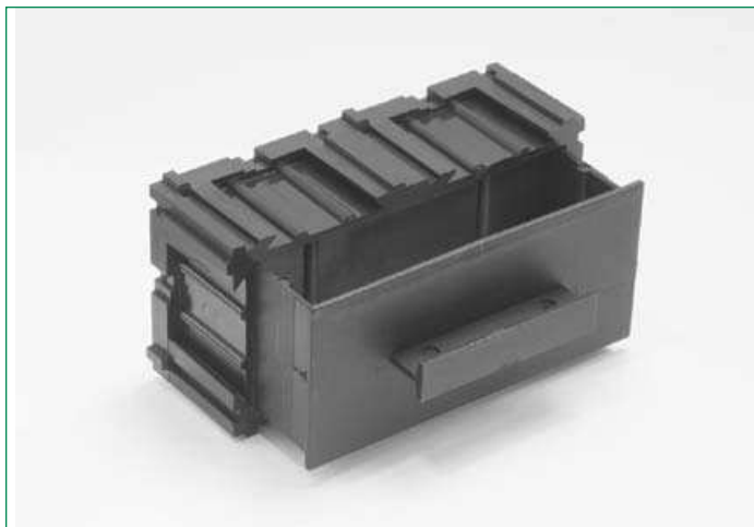
Dimensions in mm / Maße in mm