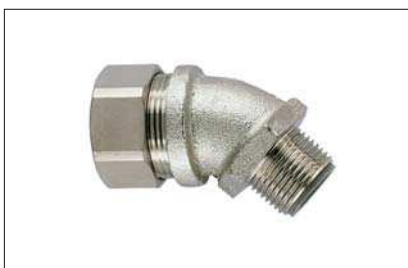
HelaGuard LTS-45FMC 45° Elbow Compression Fitting.