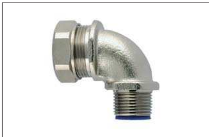
HelaGuard LTS-90FMC 90° Elbow Compression Fitting.