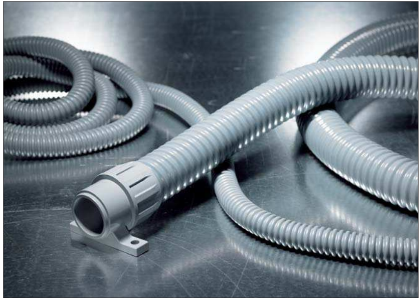
FlexiGuard FG with FG-UH fitting.

FlexiGuard protective hoses are used to protect cables in machines and plant construction, and robotics as well as leads to switch cabinets.