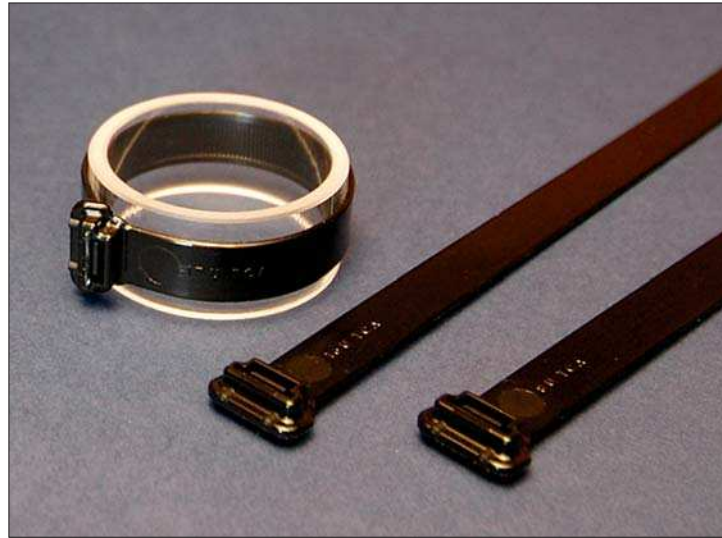
The wide strap cable tie accommodates a large range of bundle diameters: 9.5mm - 104mm.