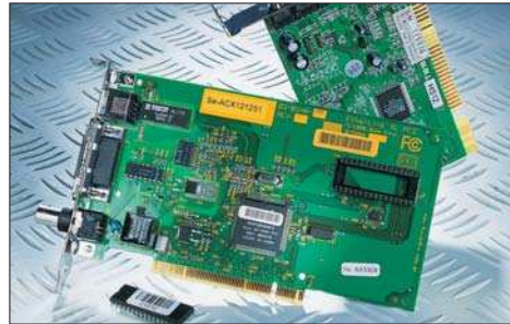
Secure identification of component parts and circuit boards with Helatag.

For problem-free printing, we recommend Tagprint Pro software, TT4000+ and TT420+ printers with TT822OUT and TTDTHOUT ribbons.