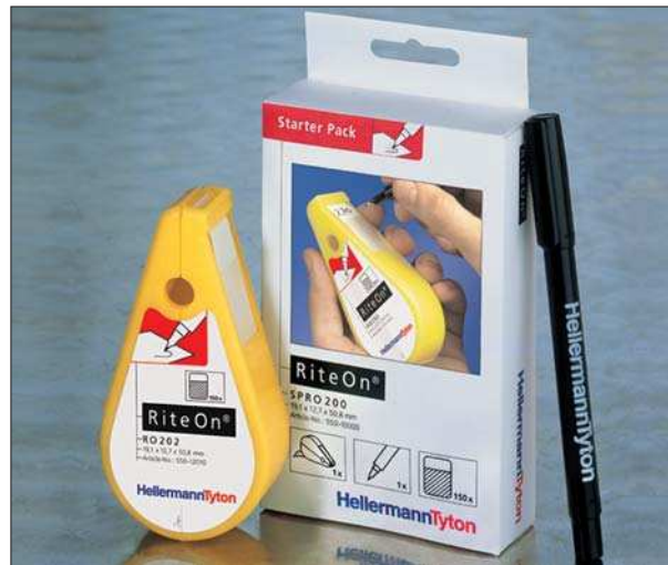
The RiteOn starter pack gets you started right away.