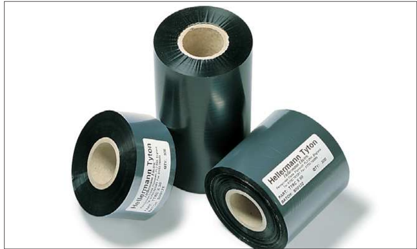
Ribbons for printing on labels.

The ribbons are attuned to the various label materials to reach the high quality print matching the industrial needs.