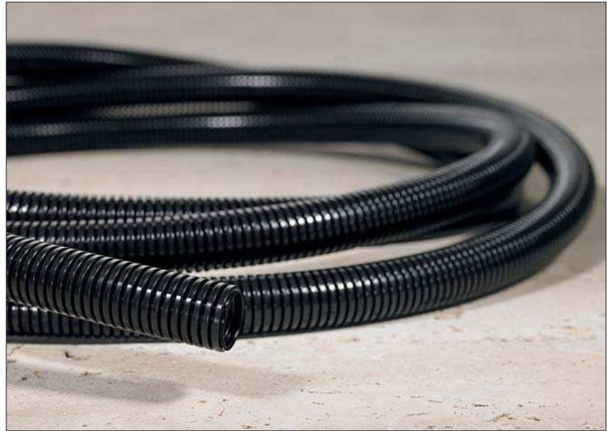
HelaGuard PA6 Light is very flexible and can be used in moving applications.

Machine building, plant construction, control panels and public buildings, wherever lower mechanical protection is required.