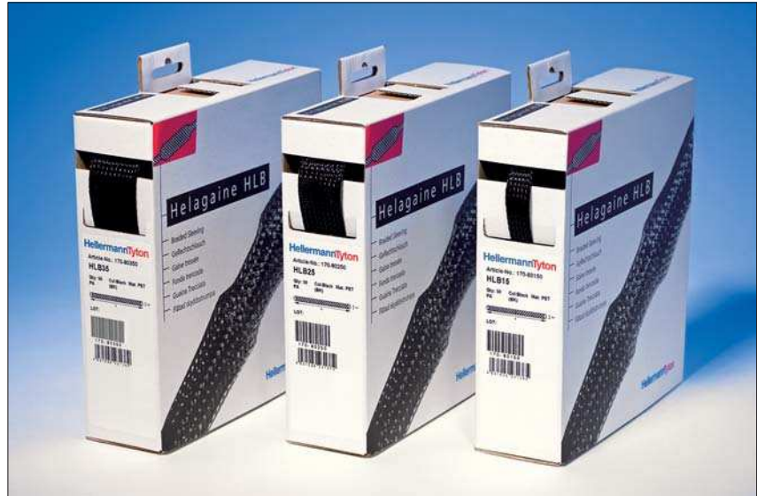
Helagaine HLB: The expansion rate makes it possible. Only three sizes in a handy dispenser box for almost all standard diameters.

Helagaine HLB is supplied in practical dispenser boxes and covers a wide range of applications with only a few sizes. It is ideal for both the professional and the home user. Helagaine HLB bundles and effectively protects cables and wires, for instance in HiFi systems and in industrial plants. Helagaine HLB also provides good resistance to abrasion.