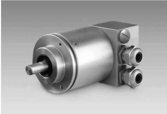
GEMMW with modular bus cover