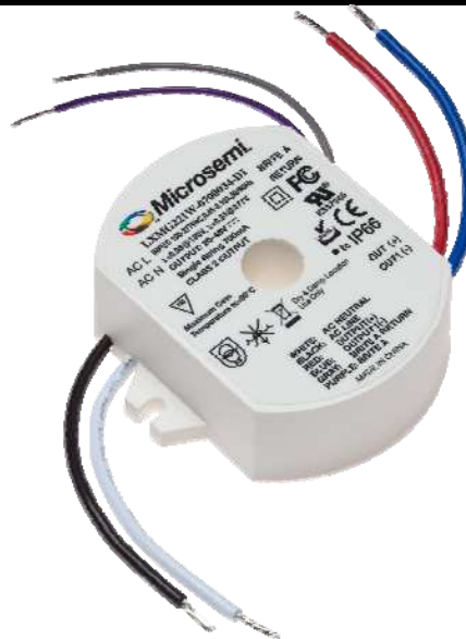
Photo is representative only, actual product may differ slightly