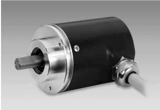
GXP1W with clamping flange