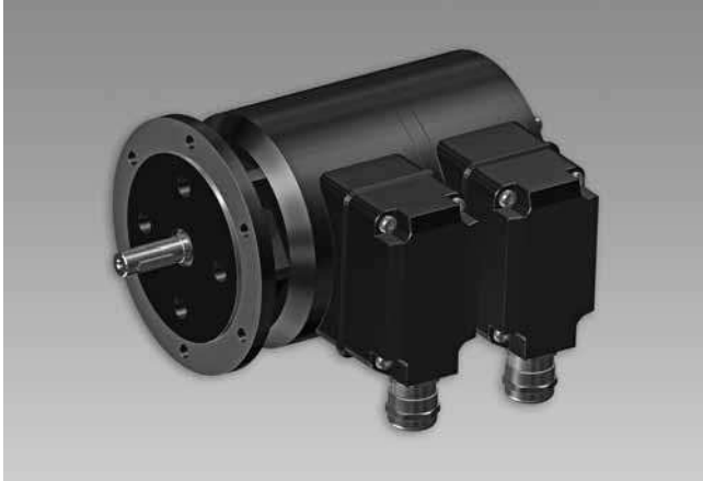
POG 11 G