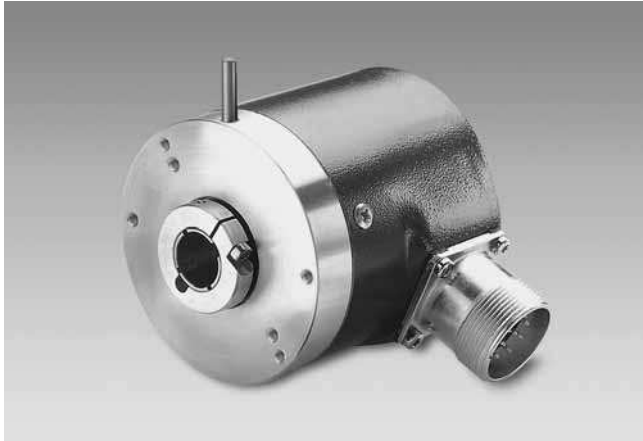
GBA2S with end shaft