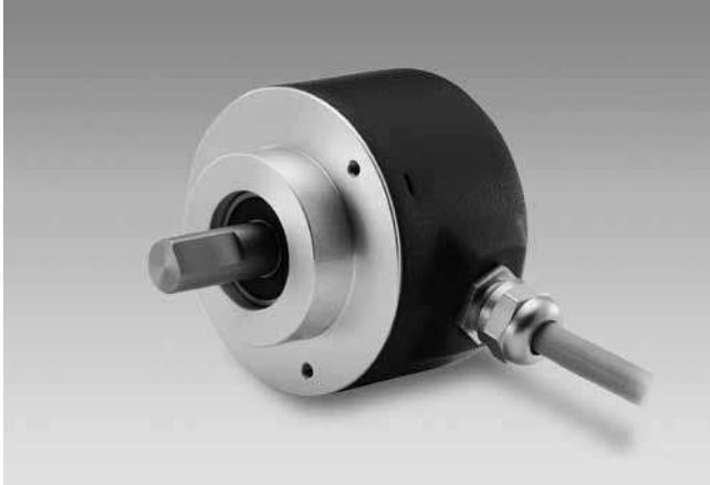
GPI0W with clamping flange