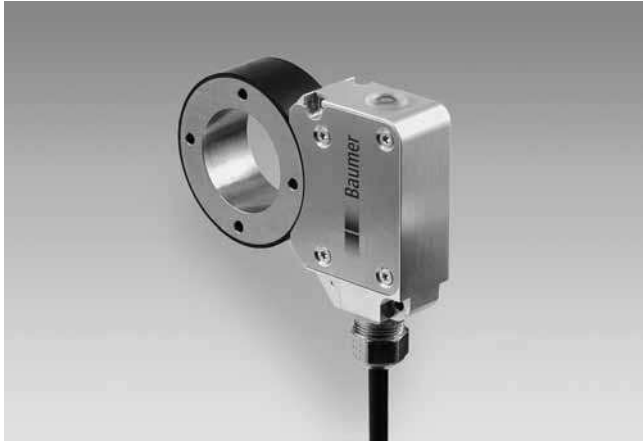
MHAD 50 with cable