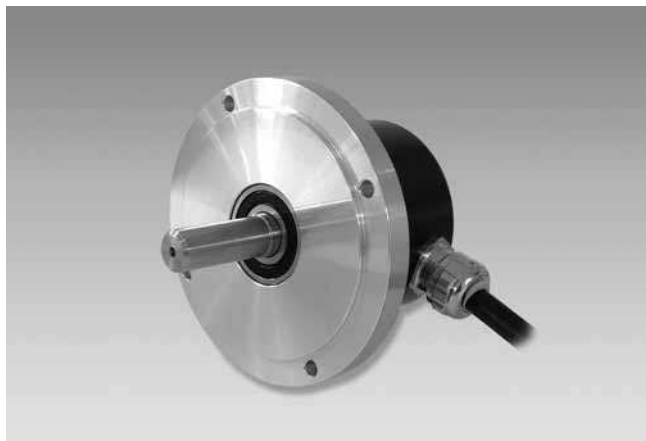
ITD 21 B10 Y 2 with mounting flange