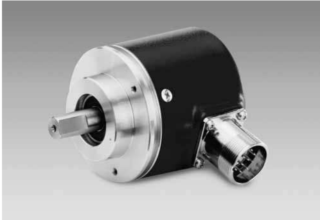
GXL2W with clamping flange