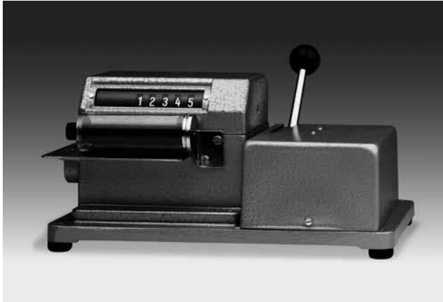
FD270 - Impulse counter