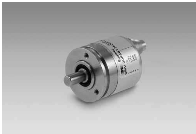
BRIV 30R with shaft