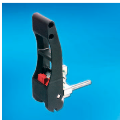
Bottom Handle with ESD pin

Optional screws for fixing front panels: M2.5, 100 pcs.: Cross recessed 1904-41 (12.7 mm), Torx: 1904K41 (11.3 mm)