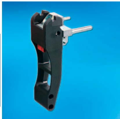
Top Handle with ESD Pin