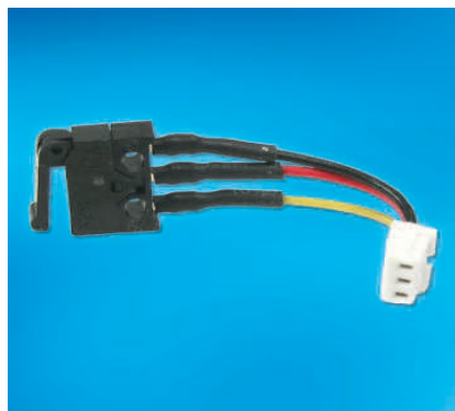
Microswitch for Injector/Ejector Handle

Optional screws for fixing front panels: M2.5, 100 pcs.: Cross recessed 1904-41 (12.7 mm), Torx: 1904K41 (11.3 mm)