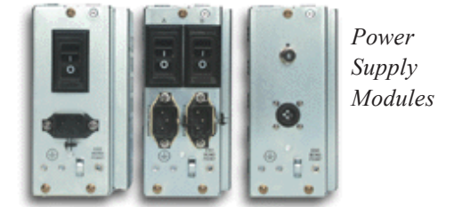
Power Supply Modules

Installed in the rear of the chassis. Enables easy installation of different power inlet modules, supporting both AC and DC power sources.