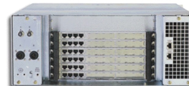
Rear View of Polaris

80 mm boards with PIMs (PMC Interface Modules). The Transition Modules and PIMs are available to suit multiple design requirements. Visit our website for more information on these products.