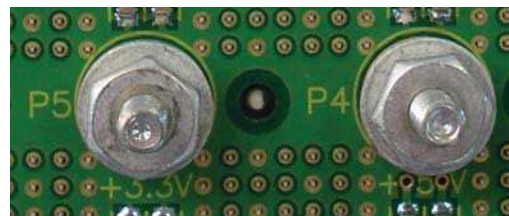
Close-up of Power Studs