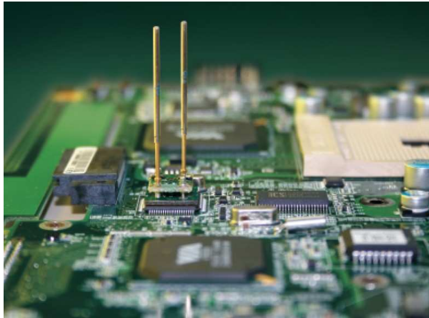
Framescan tools simplify test program development and increase fault coverage.

The Framescan™ tool suite is available for Teradyne TestStation systems. The tools in the suite can detect faults on component packages and connector pins using vectorless test techniques. Framescan tools detect faults by applying a stimulus signal to a node on a printed circuit board and then by using advanced amplification and noise-filtering hardware and software algorithms to measure the voltage coupled to a capacitive plate positioned in close proximity to the component package or connector being tested.