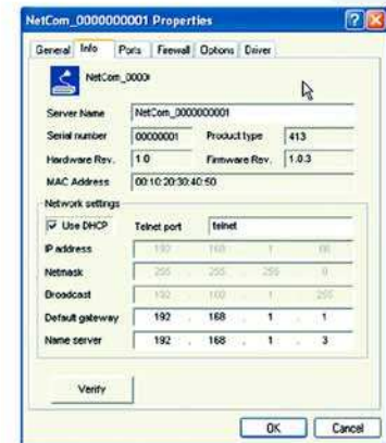
NetCom Configuration Manager

In this mode your original software application can directly control remotely located devices, such as data collection systems, over network. NetCom servers can easily be configured over WEB Browser, Driver panels, Telnet, serial Port, SNMP. NetCom Servers offer a transparent serial connection without platform and distance limitation.