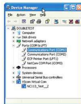
NetCom in Device Manager

The standard TCP Raw and UDP Modes are available to any operating system. Additionally Netcom comes with Com Drivers supporting Windows (NT/4.0, 2000, XP, 2003) and Linux (Fixed TTY) operating systems. After installation of the driver for a Win-OS a Netcom device appears in the Device Manager as VScom Virtual Com. Driver panels offer a feature-rich and easy configuration of all parameters. Netcom drivers establish a transparent connection between host computer and serial device located anywhere on TCP/IP net. Existing software applications directly access the serial device, similar to a local COM port. Specialized applications are supported by the Null Modem Tunnel of NetCom Serial Device Servers. Two serial ports are connected via network, together they simulate a long Null Modem cable. Modem Emulation is provided by IP Modem option. The NetCom "dials" to a second NetCom, both controlled by standard AT-command set on the serial port. A Modem driver file for Windows is provided.