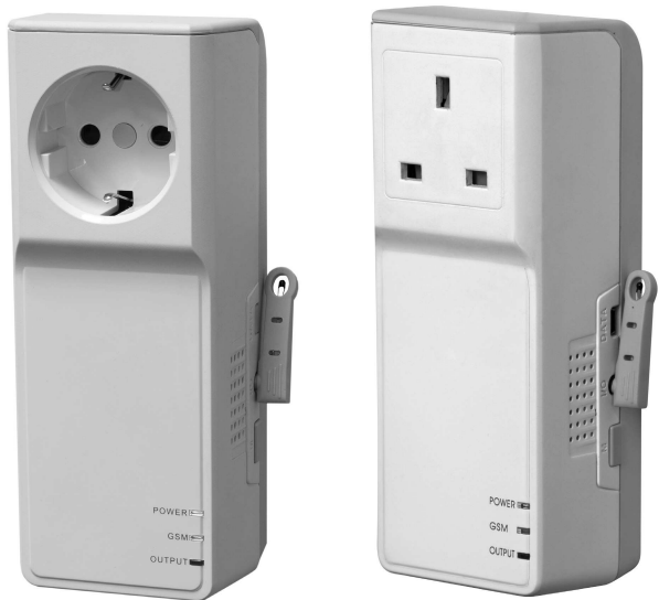
GSM POWER SOCKET