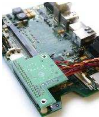
LVDS Converter installed on Orchid