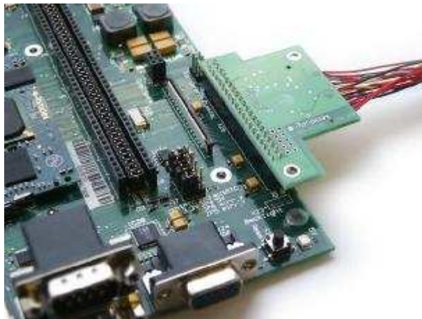
LVDS Converter installed on the Colibri Evaluation Board

For the installation of the LVDS Converter on Colibri Evaluation Board or on Orchid be cautious to match the Pin 1 indicators of both connectors.