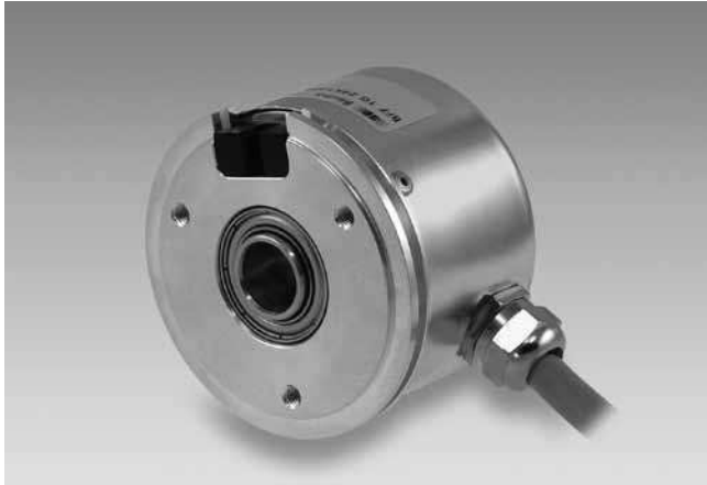
BFF SSI with end shaft