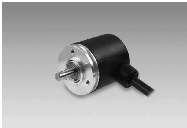
BDK with shaft