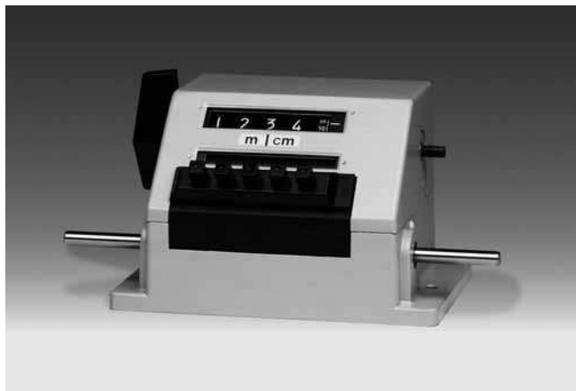
ME282 - PTB Meter counter