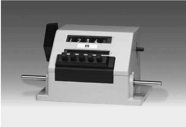
ME280 - Meter counter