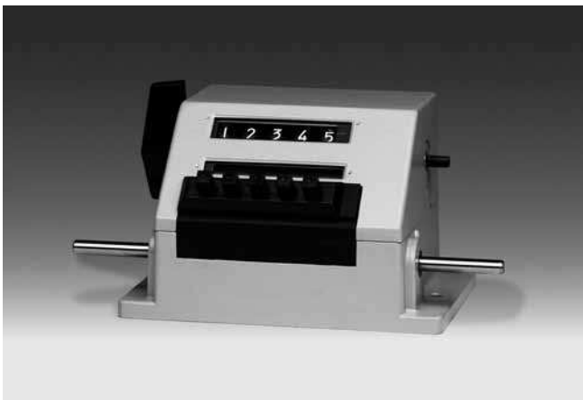
UE280 - Revolution counter