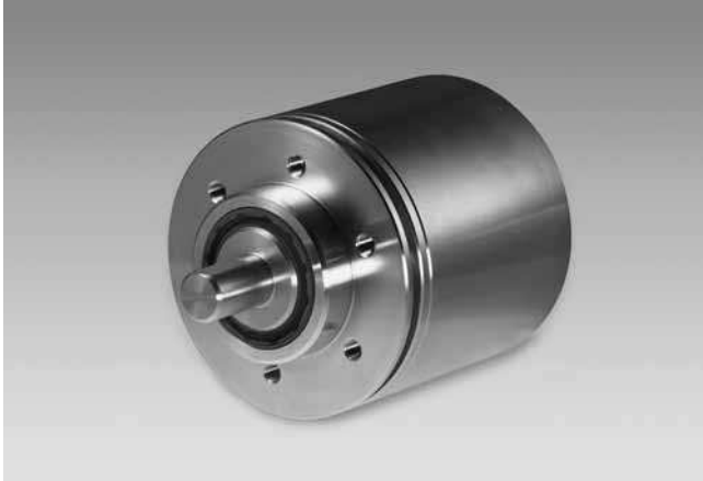
X 700 with EX-proof housing