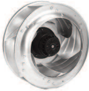
Duct Ring: DR400A (optional)