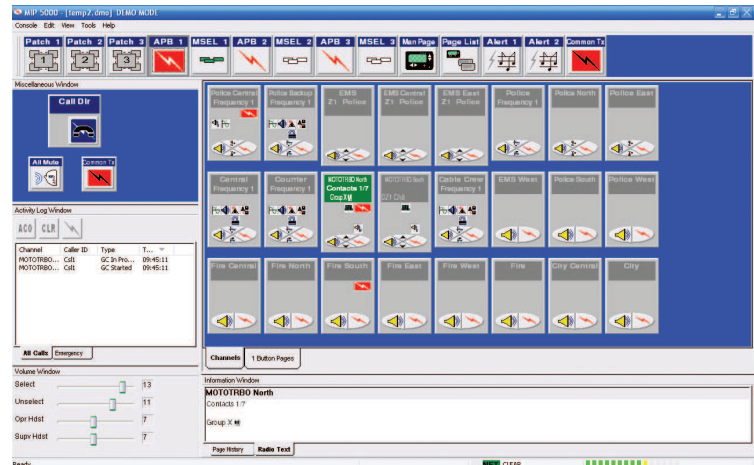
The MIP 5000 VoIP Radio Console GUI provides extensive user options for full control of the display.

A hardware USB HASP key is required at each operator position to license and enable radio resources. USB HASP keys are available in 1, 4, 8, 12, 24 and 48 resource configurations