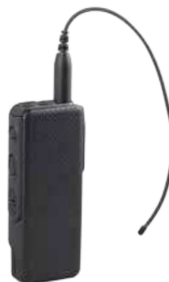
VHF FLEXI ANTENNA PMAD4125