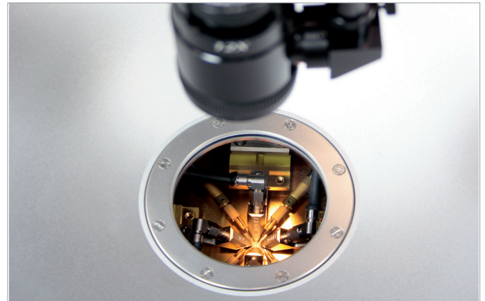
View through the view port of the chamber lid. The shown configuration consists of four RF IZI Probes® and four DC probes.

© Copyright 2015 Cascade Microtech, Inc. All rights reserved. Cascade Microtech and IZI Probe are registered trademarks, and ProbeWedge is a trademark of Cascade Microtech, Inc. All other trademarks are the property of their respective owners.