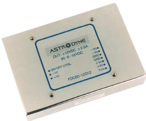
Unit measures 2.76"W x 3.94"L x 0.75"H