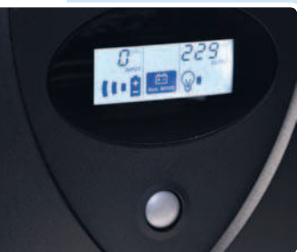
○ LCD Display