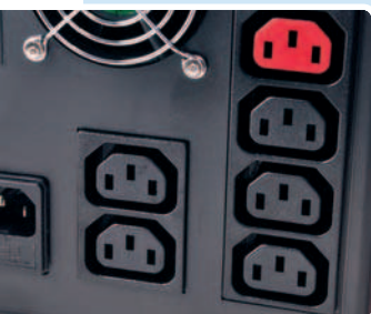
○ Separate Surge Protected & Battery Backup Outlets