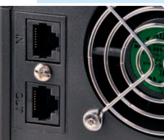
○ Modem, Phone Line, Network Surge Protection