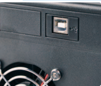
○ USB Communication Ports