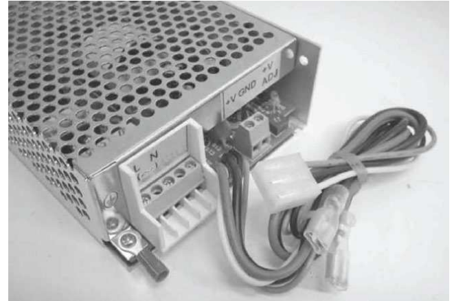
Fig. 1 connections