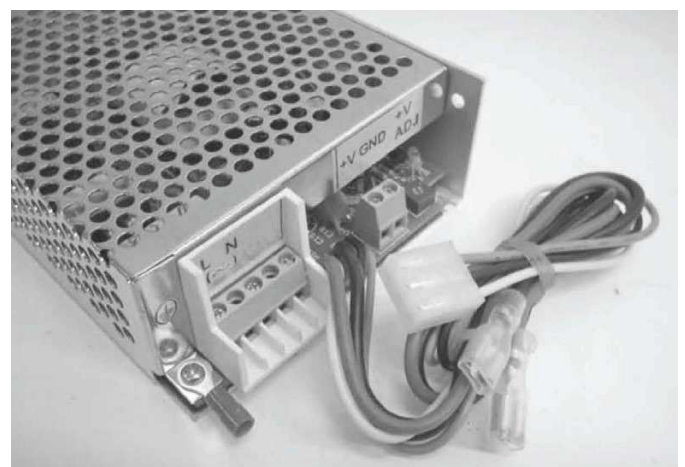
Fig. 1 connections