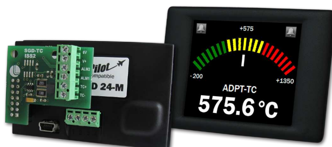
SGD 24-M not included

This add-on module interfaces directly with any PanelPilot-compatible display. It has built-in cold-junction compensation (CJC) and takes it's power directly from the SGD meter.