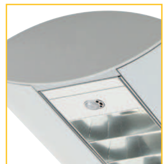
COM4 Louvre Mounted Option