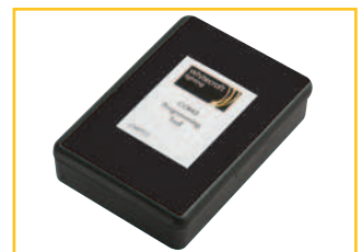
Handheld Programmer COMPTC