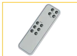
Handheld Controller COMHC