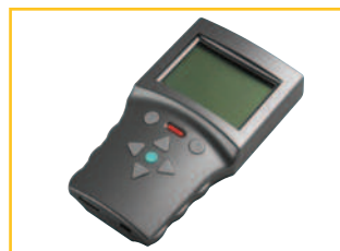
Advance Programmer COMAP