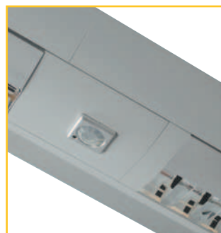
COM3 Infill Mounted Option