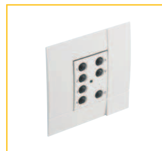
Modular Switch Panel