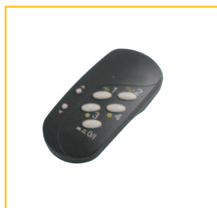
Hand Held Controller