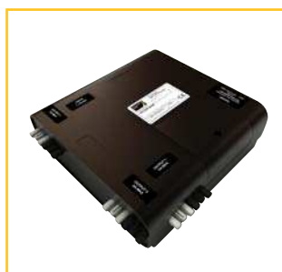
DALI Addressable Hub

A full range of complimentary DALI components are available, a selection of which are illustrated below. For our full range of DALI components, please look in the Controls section starting on page 266