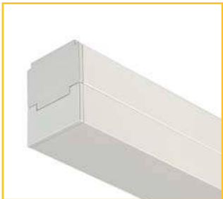
Cover End Cap