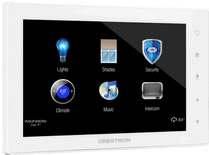
TSW-750-W-S – Shown in White