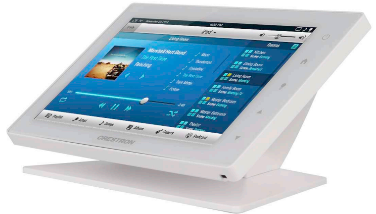
TSW-750-W-S with TSW-750-TTK TableTop Mounting Kit