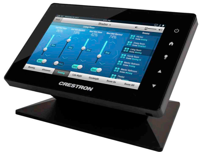
TSW-550-B-S with TSW-550-TTK TableTop Mounting Kit