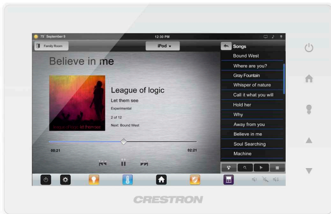
TSW-550-W-S – Shown in White