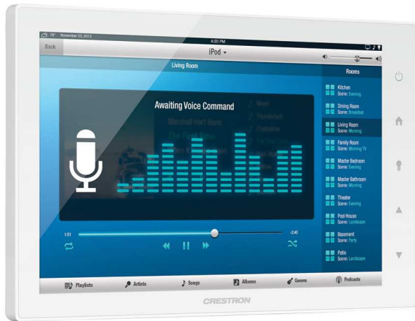
TSW-1052-W-S – Shown in White